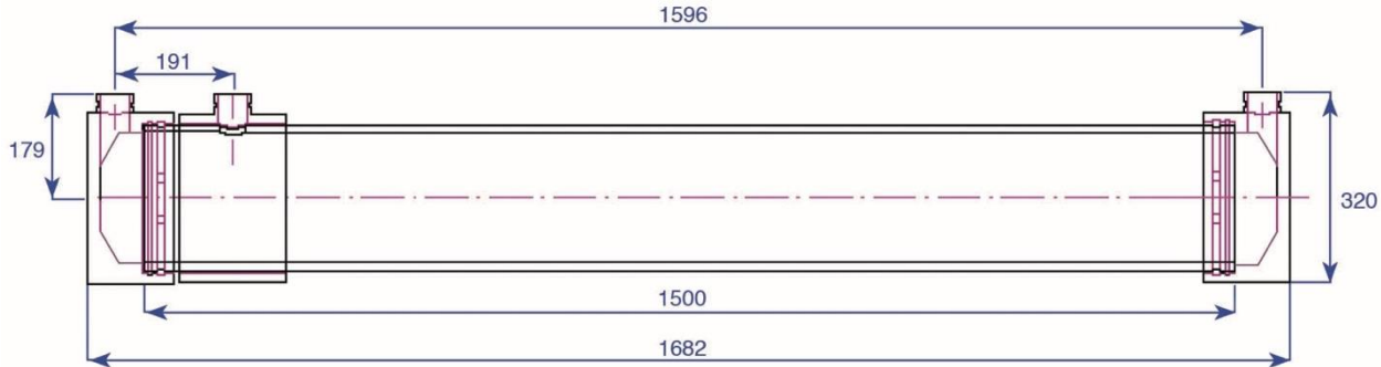
Figure 2: ZW700B-10060 SB 2.2